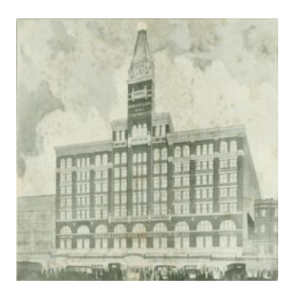
The Marcus Clark department store Railway Square, Sydney

Retailing began moving uptown towards Market Street where David Jones and Myer (previously Grace Bros., before that Farmers) now stand. The huge Westfield Tower shopping mall recently opened in the same area. In 1966, the Marcus Clark chain was sold off to the Waltons chain which itself soon disappeared. The iconic store, minus the revolving globe on its tower, still stands in Railway Square as a reminder of another era. The building has been converted into offices and facilities for the NSW Department of Technical and Further Education.