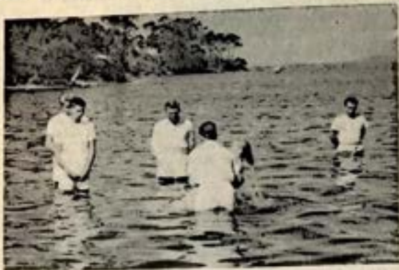
Baptisms at Lake Macquarie Camp.

The Youth Centres are more than that. They are schools and colleges for training church members. Church family camps have proved their value. As conference centres, the Youth Centres have proved their worth as superintendents, secretaries, Christian Endeavour and club leaders get together for the sharpening of their minds and learning of better methods and techniques.