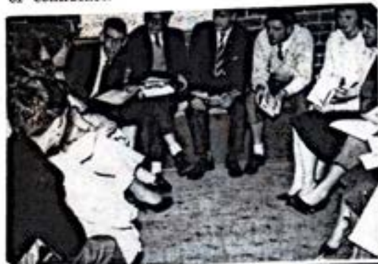
A FINGER ON THE PULSE.

The general reaction of our brethren was to urge us to pursue our forward policy, to expand, to adventure. Feelers we put forward tentatively were taken up and exceeded beyond our remotest hopes and that almost unanimously. Thank you brethren for that expression of confidence.