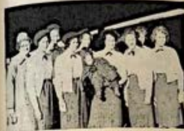
N.S.W. Basketball players off to Perth.

We now have 1023 boys and 1241 girls as an overall membership in clubs, and of these we have 31 Girls Life Brigades with 773 members and 34 Boys' Brigades with 686 members.