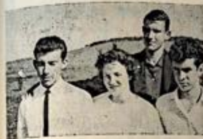
Four campers baptised at Watchnight Service, Midnight 31/12/'61, at Illawarra.

Faulconbridge is still available to us by the courtesy of Bro. Owen Wainwright, and we are glad to say it is being used more frequently. We are in need of double-decker beds, 2ft. 6in. mattresses and pillows especially for Faulconbridge.