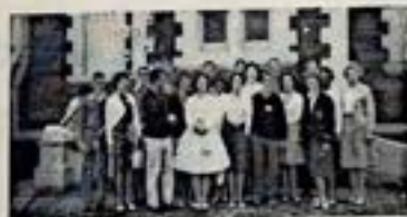
N.S.W. Delegates at the National Youth Convention — Adelaide.

CHAPEL AT YOUTH CENTRE: The Department has been investigating the possibility of erecting a chapel at the Youth Centre with a view to evangelising the district where other Churches have prosperous works.