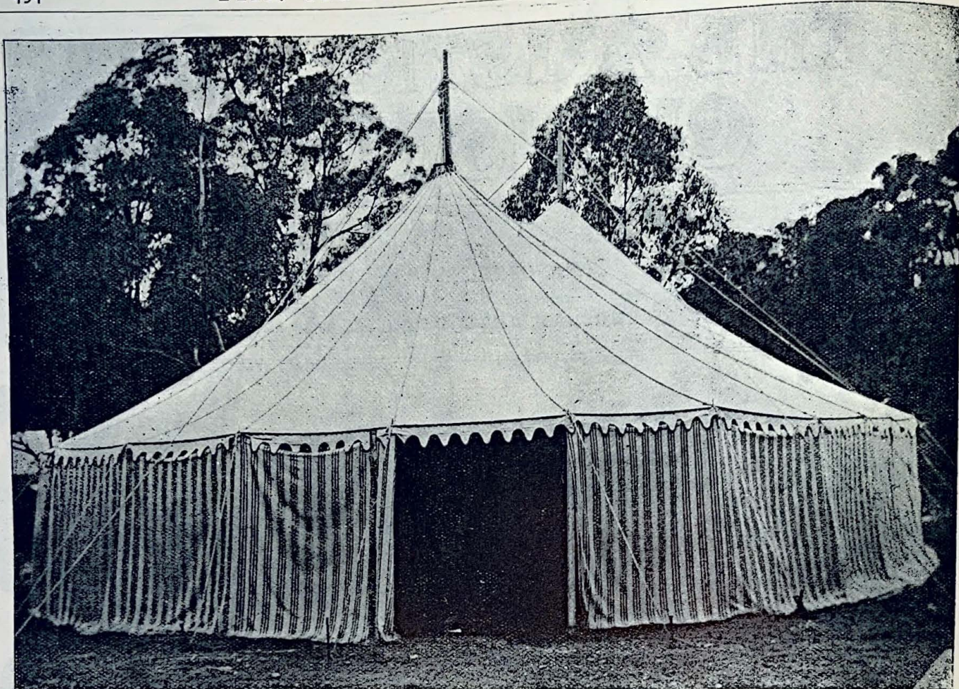
THE SOUTH AUSTRALIAN TENT.