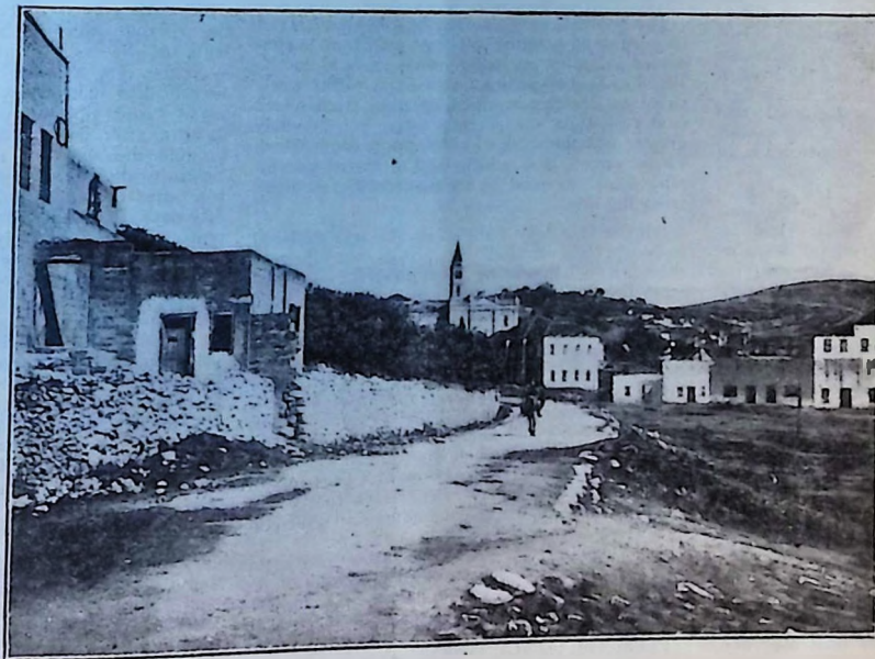
The Entrance to Nazareth.

The Disciples as a people first occupied the strategic position in the conflict on authority on religion. We are still there. To this tribunal must be submitted every appeal. All disputed questions that can be settled, will be settled in the presence of the throne of Christ and the thrones of his inspired apostles. Baptism, the name, the