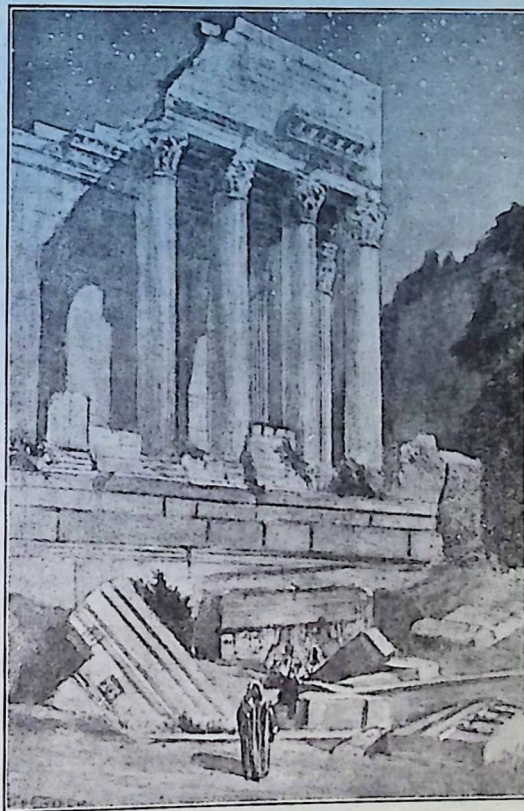
Ruins of the Smaller Temple, Baalbek.

We need to adorn the doctrine of Christ.