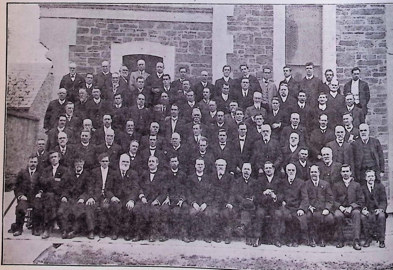
Group of Representatives at the South Australian Conference.