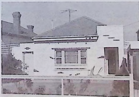
Manse of Inner Suburban Church, Ascot Vale, Vic.

This was a big undertaking for two inner-suburban churches which only a few years ago had student ministries and a total income of £18 a week. But, gradually, the churches combined their efforts, and, with one of the student ministers, evolved to a part-time and then full-time ministry, which was subsidised by the Vic.-Tas. Home Mission Department. We cannot overestimate the help and guidance given by this Department. With graciousness of character and