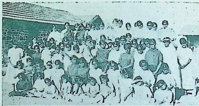
Early picture of Shrigonda Home — some of these girls are co-workers today; others have established Christian homes.