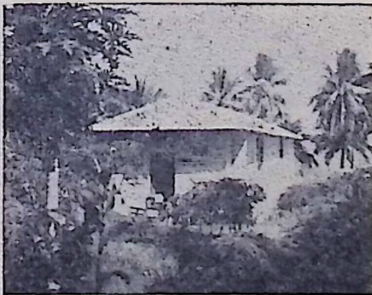
Main ward block, Aoba.

Please pray that all their efforts will be God-guided, and that there will be that burden for lost souls, that will ever keep us all ever round the throne of grace.