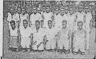
Christian group of men, Maewo. They waited long for a missionary, now they rejoice.

Some villages are long distances apart, and it would be easy for a party to be caught at dark, far from food and shelter. To provide for such emergency, at various places along the track, gardens have been planted, and anyone needing food may help himself. These particular gardens are