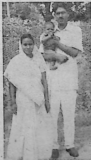
Indian parents bring their baby to Dhond Hospital for treatment.

Little things, but how wonderful it is to be able to put their little feet on the right pathway and to put an ideal before God's little children. What does