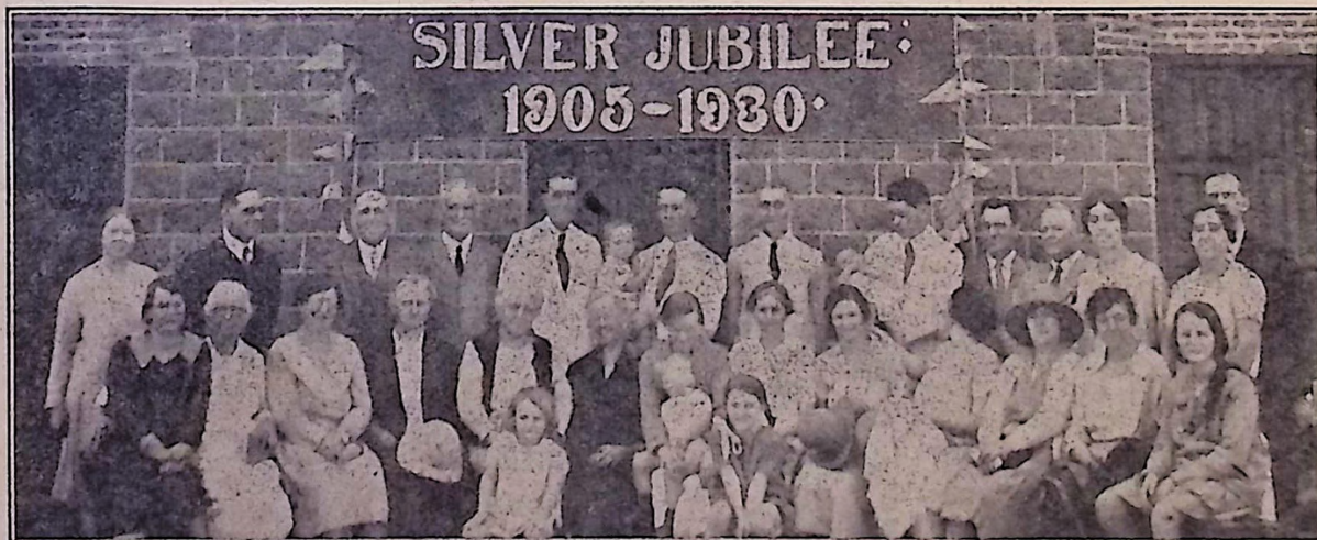
SILVER JUBILEE, INDIA, 1930.