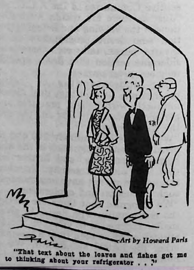
"That text about the leaves and fishes got me to thinking about your refrigerator . . ."

Roommate: "Well, you wouldn't want your new suit to get wet, would you?"