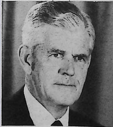
BY GARFIELD TODD

The flood of refugees is a great embarrassment to the Patriotic Front, for they have to be fed and clothed, housed and educated. These children left their homes in hundreds, growing to thousands and made their way through the bush to escape the intolerable beatings and harassment of the security forces, 50,000