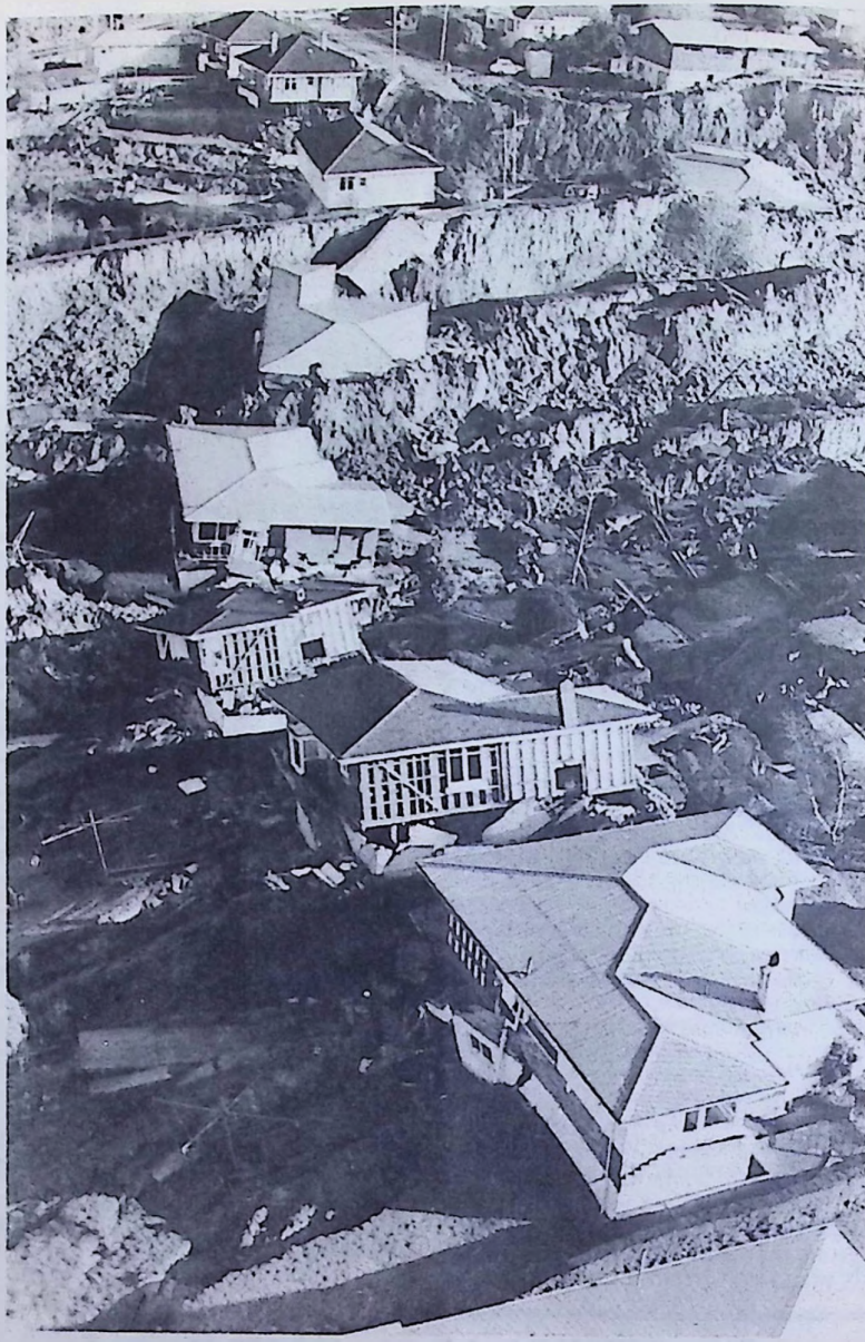
Houses in Abbotsford (N.Z.) slip.

Discussions between Anglican, Churches of Christ, Methodists, Presbyterian and Congregationalists towards unity have ground to a halt. It appears that they will not continue in the near future.