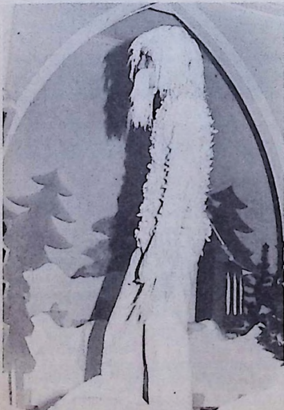
The Abominable Snowman

holidays the sets were made at an Adventure Time for the local children. They worked on each aspect of the sets decorating them themselves as well as having games and other activities each morning.