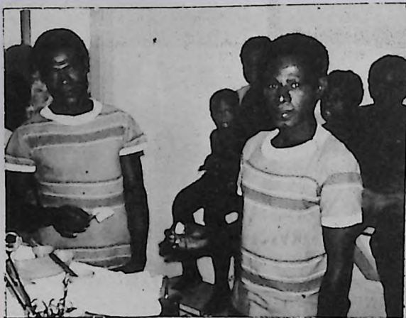
Medical Dressers at work — PNG

Demonstrate your concern and compassion for people in other lands by contributing to