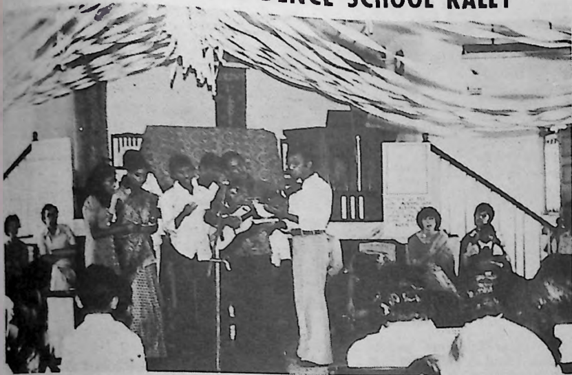
Bombay Christian Centre — Indian Sharing Venture.

At the Christian Centre on January 20, the Bombay church once again played host to a Rally for the English Course students of the Way of Truth living in the Chembur area.