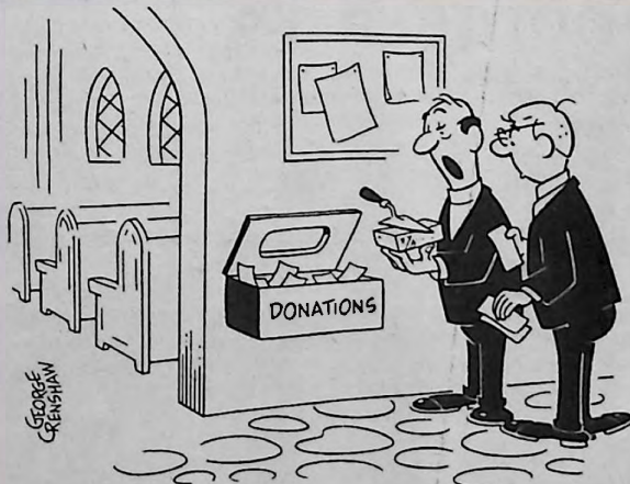
"IT'S A CONTRIBUTION FOR OUR NEW CHURCH."

Unless otherwise stated, books reviewed on this page may be obtained from: The Baptist Book Store, 162 Russell St., Melb. 3000; N.S.W. Churches of Christ Book Shop, 9 Endeavour Arcade, The Kingsway, Caringbah, 2229; United Church Bookroom, 15 Mathers Lane, Hobart, 7000.