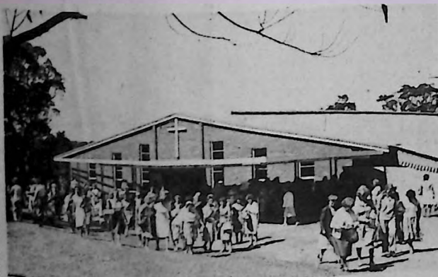
Auditorium, Stanwell Tops